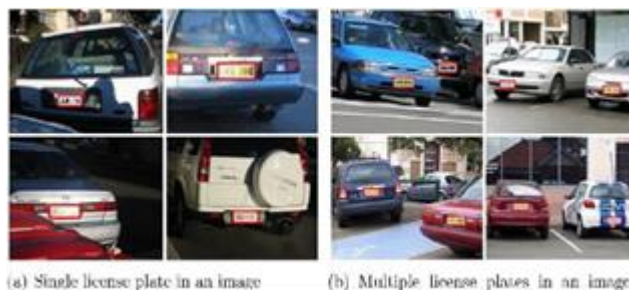
fig (3) multiple image evaluation and testing