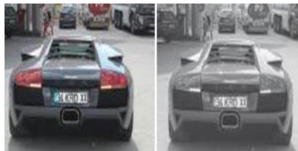
Fig (2) gray scaling

function can be layered for license plate detection at multiple condition .Here we use multiple functions that processes the image color and quality like histogram, superzoom making the image less vulnerable to noise that may affect the image processing.